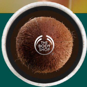
SCRUB Coconut Exfoliating Cream