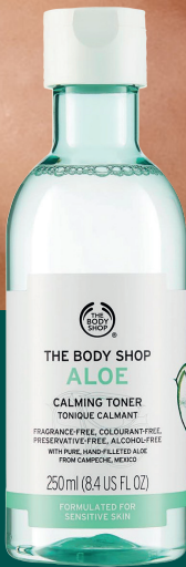
TONE Calming Toner