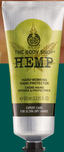
MOISTURIZE Hemp Hard-Working Hand Protector