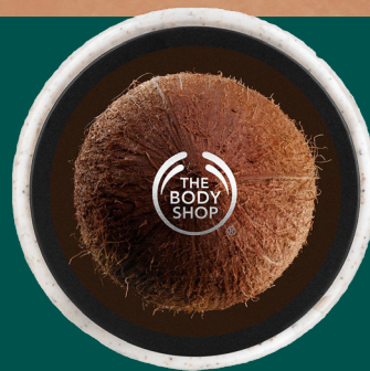
SCRUB Coconut Exfoliating Cream