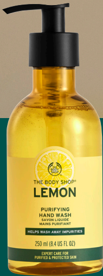
REFRESH Lemon Purifying Hand Wash