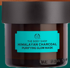
TREAT Himalayan Charcoal Purifying Glow Mask