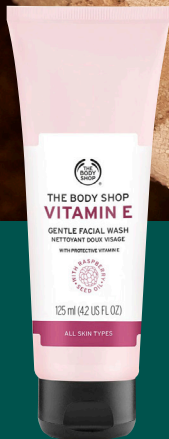
CLEANSE Vitamin E Face Wash