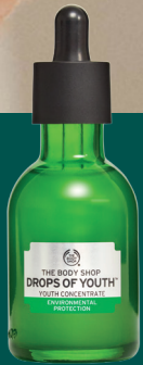
TREAT Drops of Youth™ Youth Concentrate