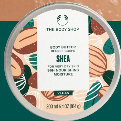
MOISTURIZE Shea Body Butter