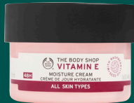
MOISTURIZE Vitamin E Day Cream