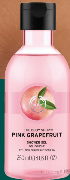
CLEANSE Pink Grapefruit Shower Gel