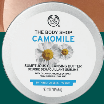
CLEANSE Camomile Sumptuous Cleansing Butter