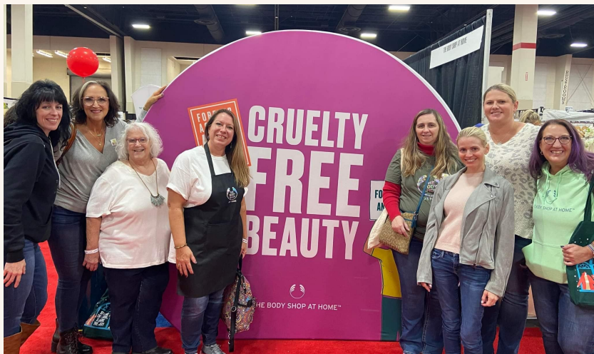
The Pineapple Society, Leaders Retreat, 2021 Salt Lake City, Utah

Congratulations on taking the first step in building YOUR business by partnering with The Body Shop at Home and our incredible team, The Pineapple Society. We're so excited to work with you on your journey!